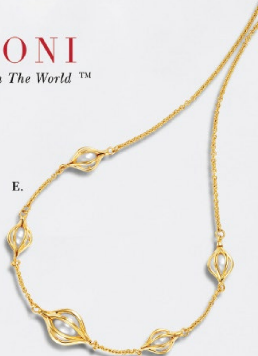
A. 18KT White Gold Freshwater Pearl and Diamond Earrings, $1,165 | B. 18KT White Gold Freshwater Pearl and Diamond Ring, $2,880 | C. 18KT Yellow Gold & Titanium Freshwater Pearl Cuff Bracelet, $1,025 | D. 18KT Yellow Gold & Titanium Freshwater Pearl Cuff Bracelet, $925 | E. 14KT Yellow Gold Freshwater Pearl Necklace 20 Inches, $1,385 | F. 18KT Yellow Gold Freshwater Pearl and Diamond Bolo Bracelet, $1,300