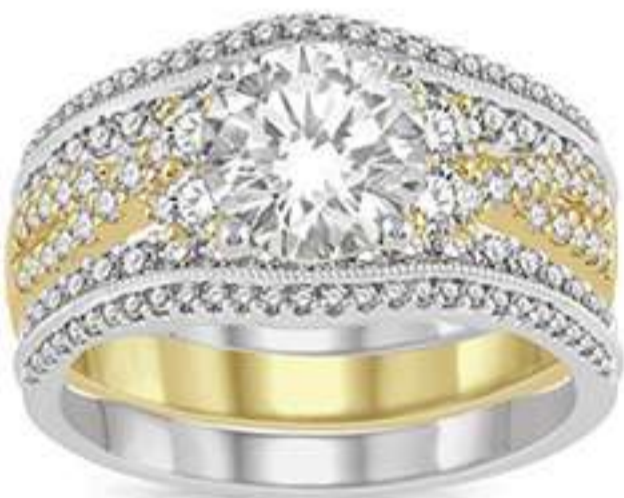
E 1 with Engagement Ring

These beautiful diamond enhancers feature brilliant baguette and round-cut diamonds combining for a bigger look.