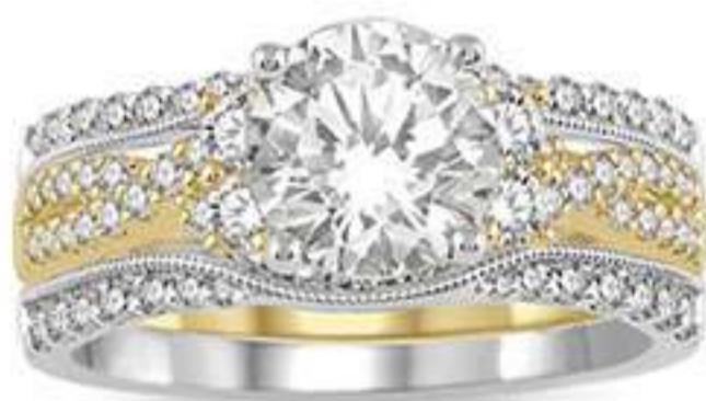
E† with Engagement Ring

Ring jackets are made to be paired with an engagement ring to create a lot more sparkle and a more dramatic stacked silhouette. They're a great way to give an original engagement ring a brand new look.