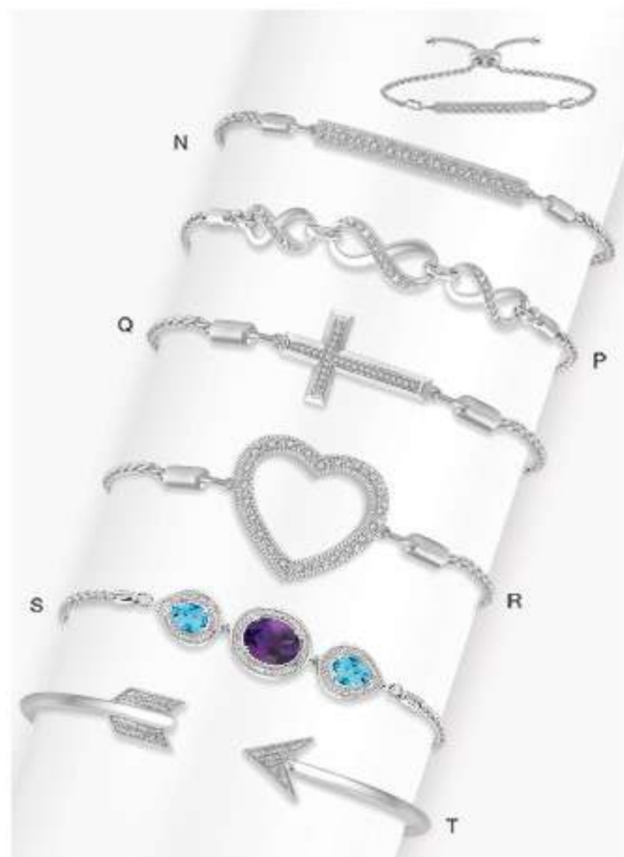
A. Amethyst and diamond pendant B. Amethyst and diamond ring C. Amethyst and diamond pendant D. Amethyst and diamond ring E. Blue topaz and diamond pendant F. Blue topaz and diamond ring G. Blue topaz and diamond earrings H. Blue topaz and diamond ring J. Blue topaz and diamond pendant K. Pearl and diamond pendant L. Pearl and diamond ring M. Pearl and diamond earrings N. Diamond bar lariat bracelet P. Diamond infinity lariat bracelet Q. Diamond cross lariat bracelet R. Diamond heart lariat bracelet S. Amethyst and Blue topaz lariat bracelet T. Diamond arrow bangle