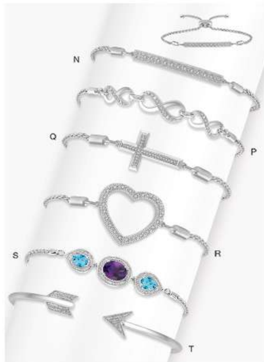
A. Amethyst and diamond pendant B. Amethyst and diamond ring C. Amethyst and diamond pendant D. Amethyst and diamond ring E. Blue topaz and diamond pendant F. Blue topaz and diamond ring G. Blue topaz and diamond earrings H. Blue topaz and diamond ring J. Blue topaz and diamond pendant K. Pearl and diamond pendant L. Pearl and diamond ring M. Pearl and diamond earrings N. Diamond bar lariat bracelet P. Diamond infinity lariat bracelet Q. Diamond cross lariat bracelet R. Diamond heart lariat bracelet S. Amethyst and Blue topaz lariat bracelet T. Diamond arrow bangle