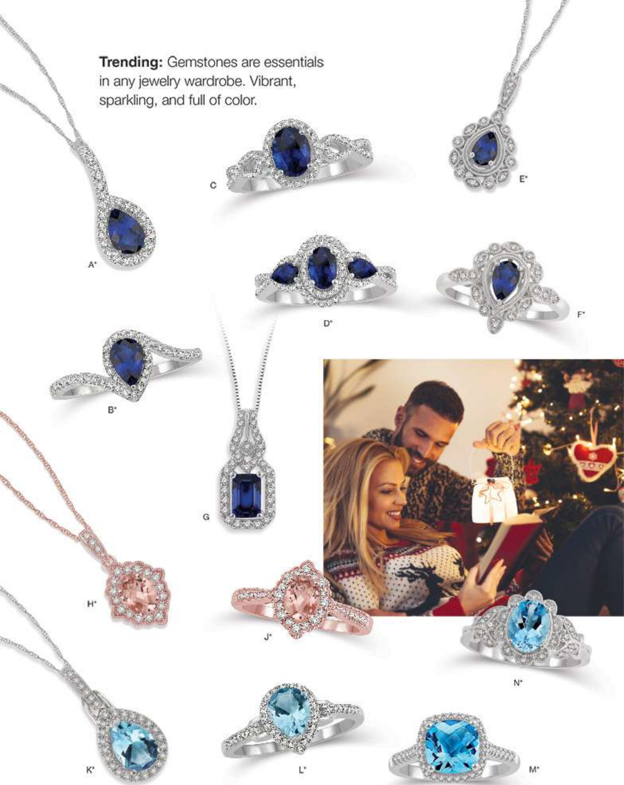
A. Sapphire and diamond pendant B. Sapphire and diamond ring C. Sapphire and diamond rings, 6x4mm, 7x5mm D. Sapphire and diamond ring E. Sapphire and diamond pendant F. Sapphire and diamond ring G. Sapphire and diamond pendant H. Morganite and diamond pendant J. Morganite and diamond ring K. Aquamarine and diamond pendant L. Aquamarine and diamond ring M. Blue Topaz and diamond ring N. Aquamarine and diamond ring

Trending: Gemstones are essentials in any jewelry wardrobe. Vibrant, sparkling, and full of color.