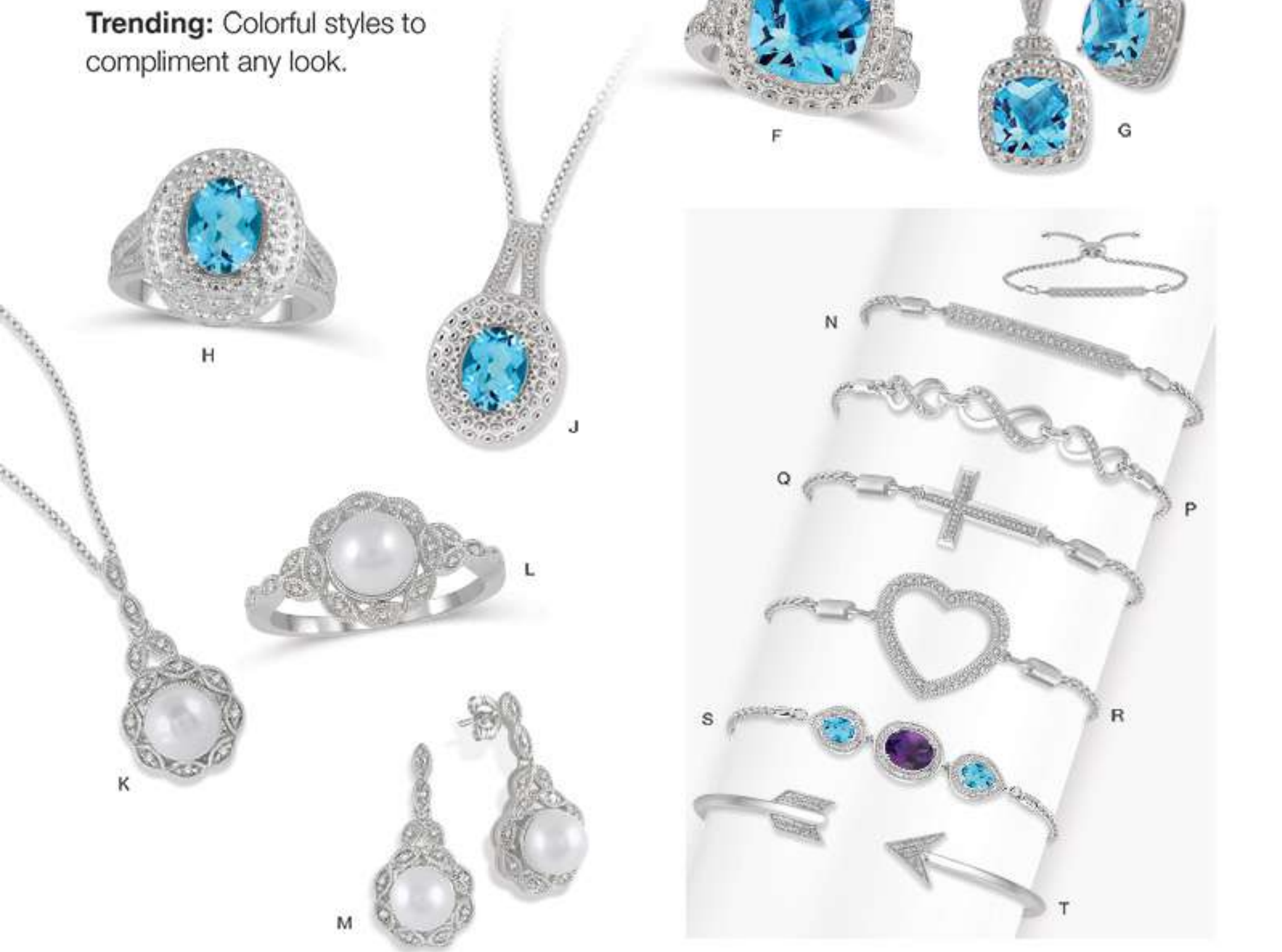
A. Amethyst and diamond pendant B. Amethyst and diamond ring C. Amethyst and diamond pendant D. Amethyst and diamond ring E. Blue topaz and diamond pendant F. Blue topaz and diamond ring G. Blue topaz and diamond earrings H. Blue topaz and diamond ring J. Blue topaz and diamond pendant K. Pearl and diamond pendant L. Pearl and diamond ring M. Pearl and diamond earrings N. Diamond bar lariat bracelet P. Diamond infinity lariat bracelet Q. Diamond cross lariat bracelet R. Diamond heart lariat bracelet S. Amethyst and Blue topaz lariat bracelet T. Diamond arrow bangle

Trending: Colorful styles to compliment any look.