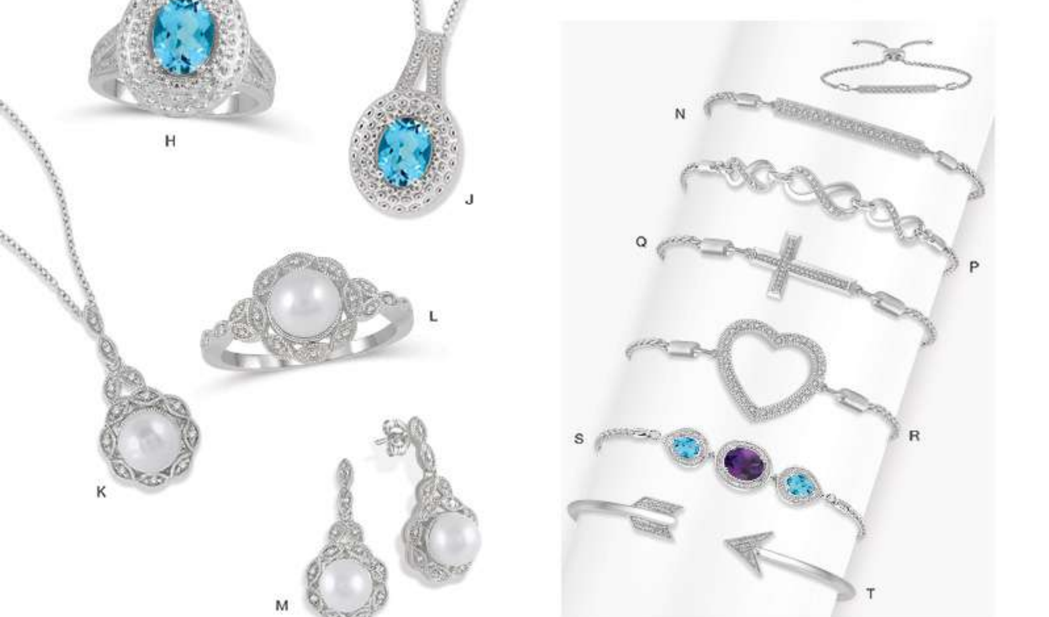
A. Amethyst and diamond pendant B. Amethyst and diamond ring C. Amethyst and diamond pendant D. Amethyst and diamond ring E. Blue topaz and diamond pendant F. Blue topaz and diamond ring G. Blue topaz and diamond earrings H. Blue topaz and diamond ring J. Blue topaz and diamond pendant K. Pearl and diamond pendant L. Pearl and diamond ring M. Pearl and diamond earrings N. Diamond bar lariat bracelet P. Diamond infinity lariat bracelet Q. Diamond cross lariat bracelet R. Diamond heart lariat bracelet S. Amethyst and Blue topaz lariat bracelet T. Diamond arrow bangle