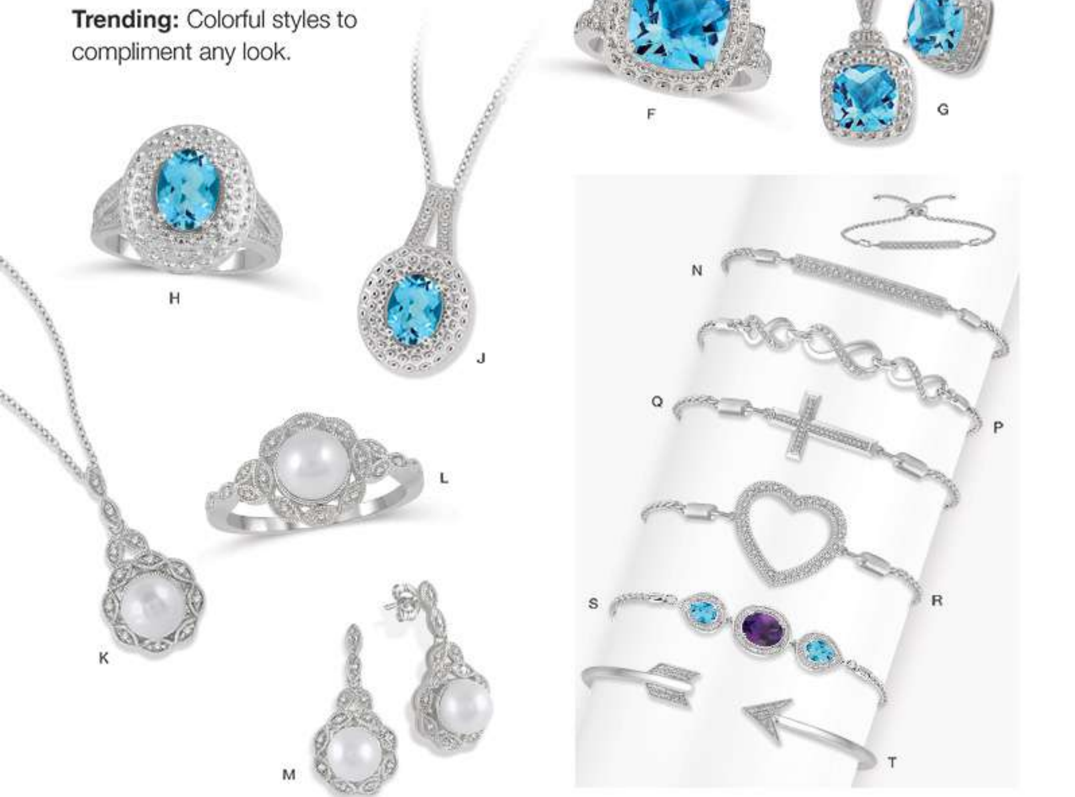
A. Amethyst and diamond pendant B. Amethyst and diamond ring C. Amethyst and diamond pendant D. Amethyst and diamond ring E. Blue topaz and diamond pendant F. Blue topaz and diamond ring G. Blue topaz and diamond earrings H. Blue topaz and diamond ring J. Blue topaz and diamond pendant K. Pearl and diamond pendant L. Pearl and diamond ring M. Pearl and diamond earrings N. Diamond bar lariat bracelet P. Diamond infinity lariat bracelet Q. Diamond cross lariat bracelet R. Diamond heart lariat bracelet S. Amethyst and Blue topaz lariat bracelet T. Diamond arrow bangle

Trending: Colorful styles to compliment any look.