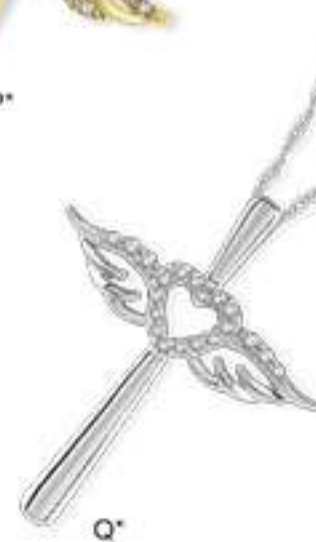
A. 1/10 carat tw cross pendant B. 1/10 carat tw cross pendant C. 1/10 carat tw cross pendant D. 1/10 carat tw cross fleur-de-lis pendant E. 1/10 carat tw cross pendant F. 1/10 carat tw cross pendant G. 1/5 carat tw infinity cross pendant H. 1/6 carat tw cross pendant J. 1/6 carat tw angel wing cross pendant K. 1/10 carat tw cross necklace L. 1/6 carat tw pave cross necklace M. 1/20 carat tw infinity cross pendant N. 1/4 carat tw cross pendant 1/2 carat tw cross pendant 1 carat tw cross pendant P. 1/10 carat tw angel wing cross pendant Q. 1/10 carat tw angel wing cross pendant