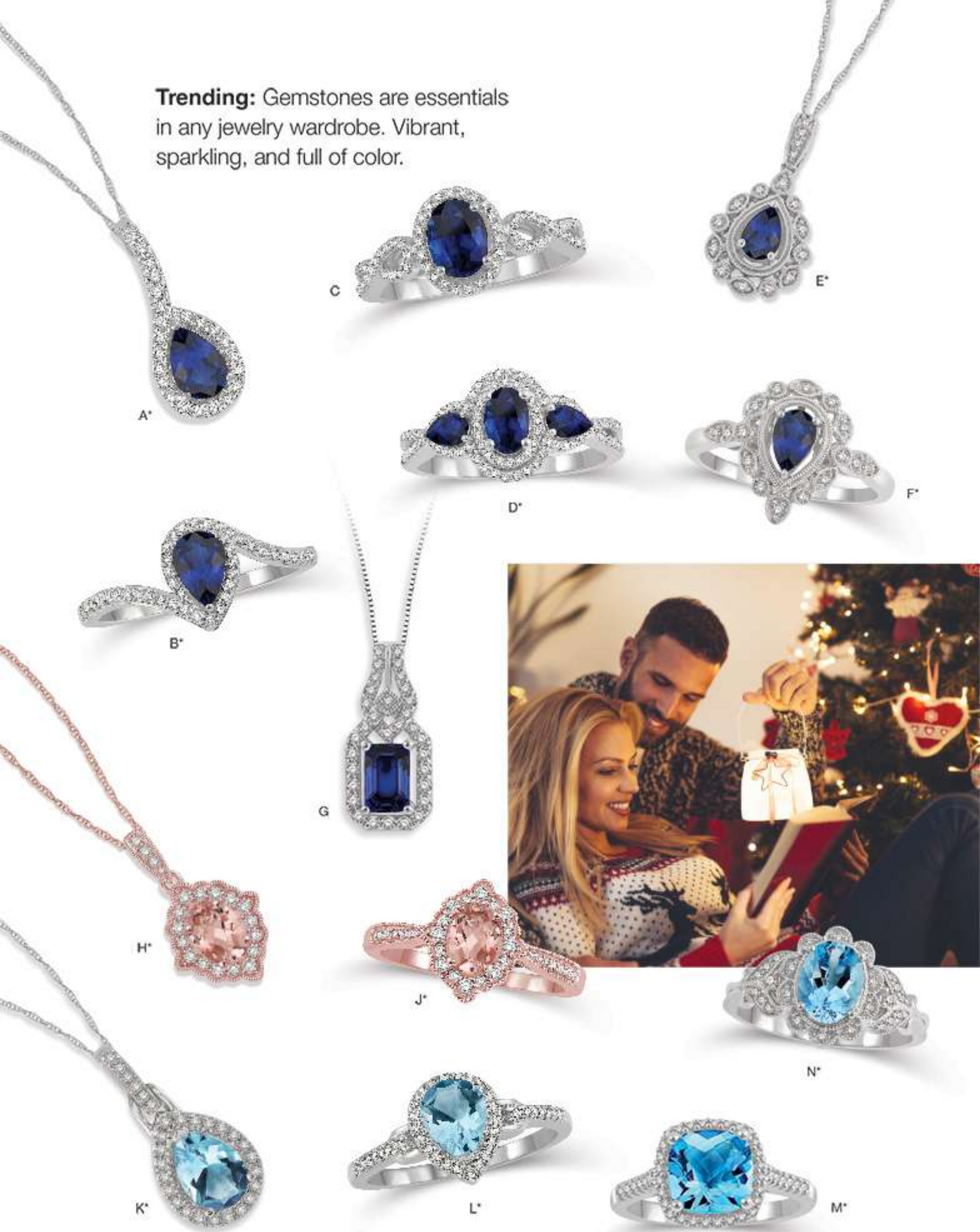
A. Sapphire and diamond pendant B. Sapphire and diamond ring C. Sapphire and diamond rings, 6x4mm, 7x5mm D. Sapphire and diamond ring E. Sapphire and diamond pendant F. Sapphire and diamond ring G. Sapphire and diamond pendant H. Morganite and diamond pendant J. Morganite and diamond ring K. Aquamarine and diamond pendant L. Aquamarine and diamond ring M. Blue Topaz and diamond ring N. Aquamarine and diamond ring

Trending: Gemstones are essentials in any jewelry wardrobe. Vibrant, sparkling, and full of color.