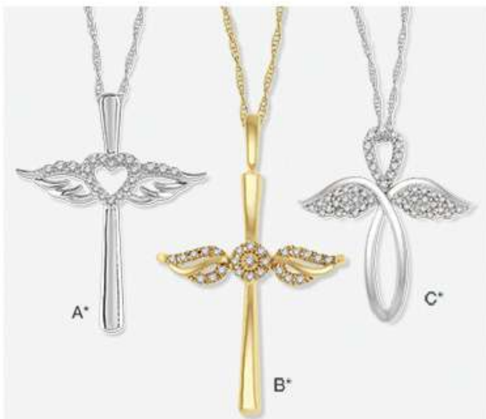
Angel Wing Crosses