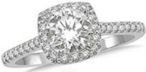
8C 3/8 Ct. t.w. Engagement Ring