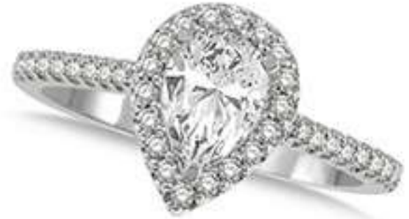
8B 3/8 Ct. t.w. Engagement Ring