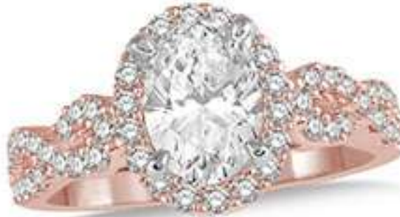
8G 1/2 Ct. t.w. Engagement Ring