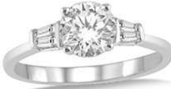
8D 5/8 Ct. t.w. Engagement Ring