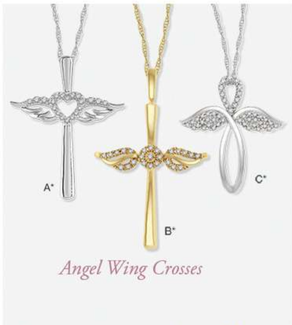
Angel Wing Crosses