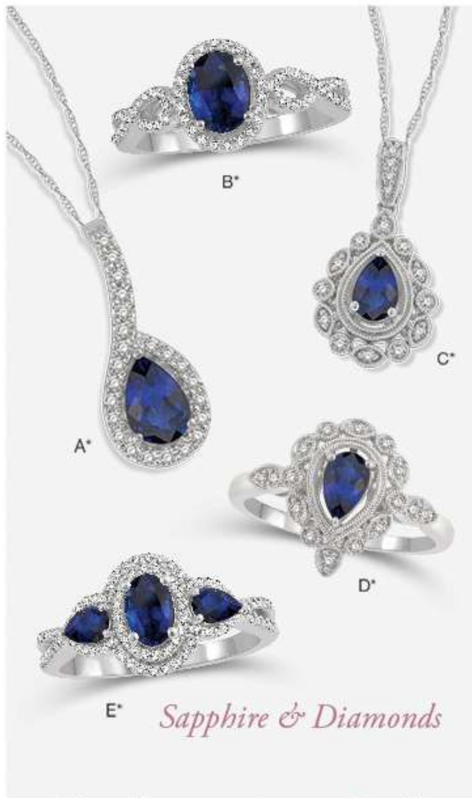
E* Sapphire & Diamonds