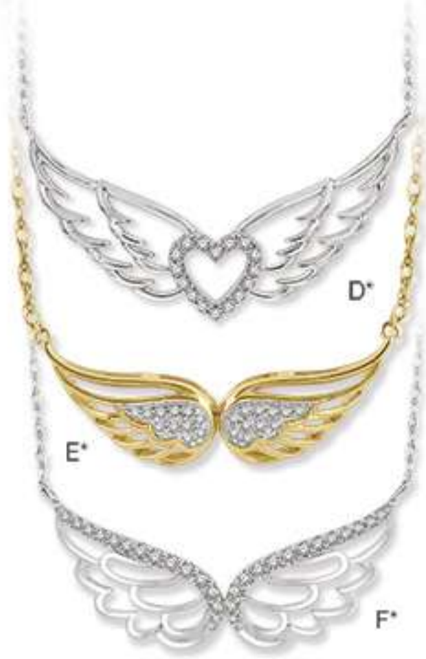
Angel Wing Necklaces