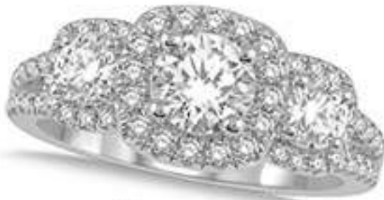
8E 7/8 Ct. t.w. Engagement Ring