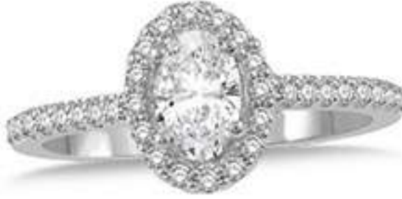
8A 3/8 Ct. t.w. Engagement Ring

SCAN ON YOUR SMART PHONE OR LOG ONTO www.raesjewelry.com