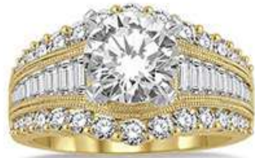
8F 1 1/2 Ct. t.w. Semi Mounting Center Diamond not Included