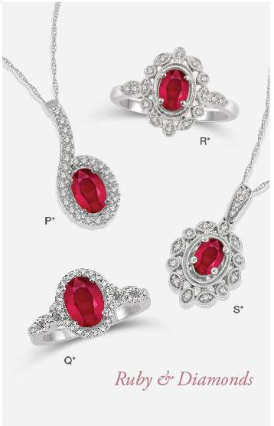
Ruby & Diamonds