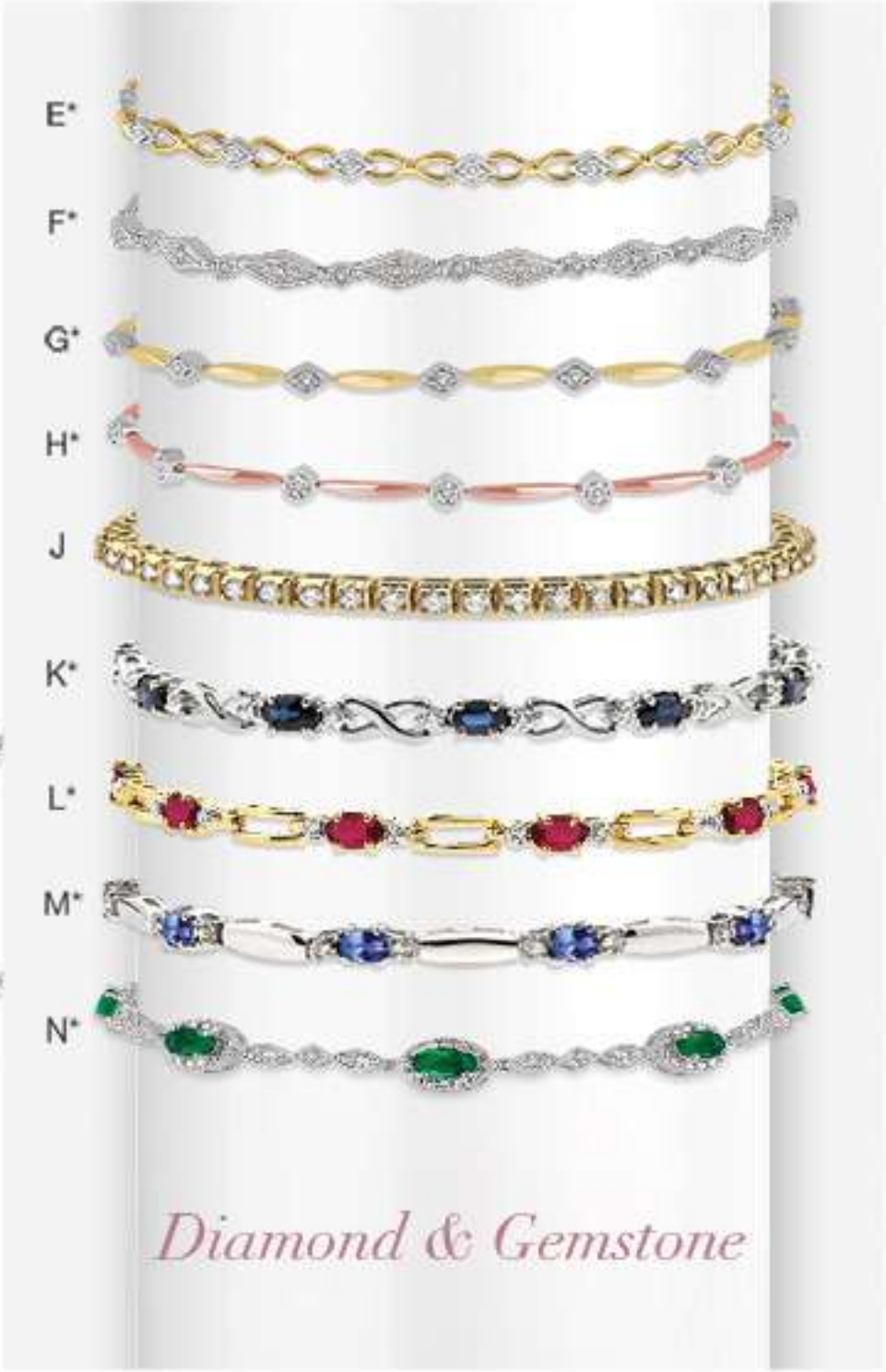
Diamond & Gemstone