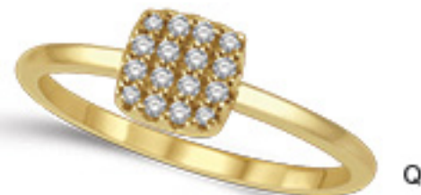
A. 1/10 carat tw star pendant B. 1/10 carat tw bezel pendant C. 1/10 carat tw horseshoe pendant D. 1/20 carat tw bumble bee pendant E. Evil eye diamond necklace F. 1/10 carat tw star ring G. 1/5 carat tw fashion ring H. 1/20 carat tw bumble bee ring J. 1/10 carat tw clover ring K. 1/20 carat tw crescent moon ring L. 1/10 carat tw round disc ring M. 1/10 carat tw horseshoe ring N. 1/10 carat tw bezel diamond ring P. 1/12 carat tw bar diamond band Q. 1/8 carat tw cushion ring