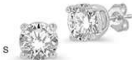
Stud Earrings Collection