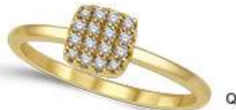
A. 1/10 carat tw star pendant B. 1/10 carat tw bezel pendant C. 1/10 carat tw horseshoe pendant D. 1/20 carat tw bumble bee pendant E. Evil eye diamond necklace F. 1/10 carat tw star ring G. 1/5 carat tw fashion ring H. 1/20 carat tw bumble bee ring J. 1/10 carat tw clover ring K. 1/20 carat tw crescent moon ring L. 1/10 carat tw round disc ring M. 1/10 carat tw horseshoe ring N. 1/10 carat tw bezel diamond ring P. 1/12 carat tw bar diamond band Q. 1/8 carat tw cushion ring