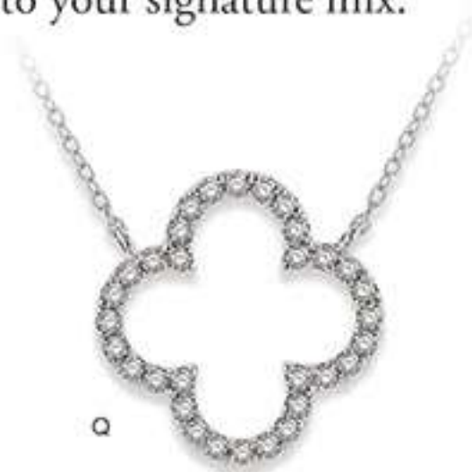
L to S available in 1/4 ctw, 1/2 ctw, 3/4 ctw & 1.00 ctw