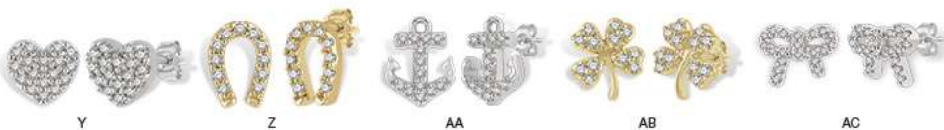
A. 1/10 carat tw bolt pendant B. 1/6 carat tw butterfly pendant C. 1/10 carat tw leaf pendant D. 1/20 carat tw crescent moon pendant E. 1/8 carat tw square pendant F. 1/10 carat tw huggies G. 1/10 carat tw huggies H. Sapphire and diamond huggies J. 1/10 carat tw huggies K. 1/10 carat tw huggies L. Sapphire and diamond huggies M. 1/10 carat tw bolt earrings N. 1/5 carat tw butterfly earrings P. 1/8 carat tw leaf earrings Q. 1/10 carat tw crescent moon earrings R. 1/10 carat tw earring climbers S. 1/6 carat tw huggies T. 1/8 carat tw huggies U. 1/5 carat tw huggies V. 1/10 carat tw huggies W. 1/6 carat tw huggies X. Pearl and diamond huggies Y. 1/10 carat tw heart earrings Z. 1/10 carat tw horseshoe earrings AA. 1/10 carat tw anchor earrings AB. 1/10 carat tw clover earrings AC. 1/8 carat tw bow tie earrings

All styles shown on this page are 10kt Gold