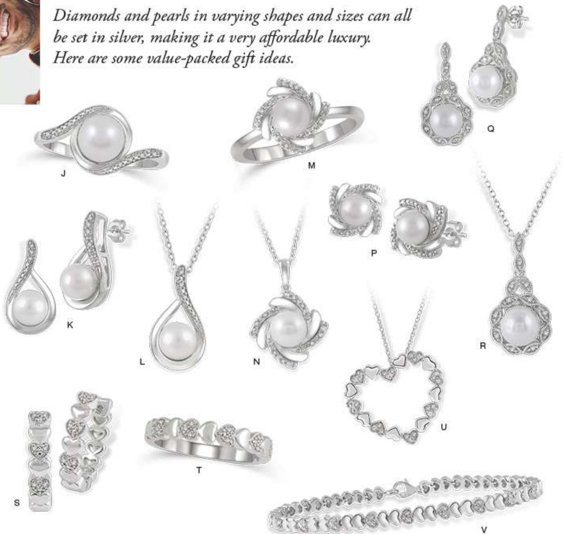
A. diamond heart arrow pendant B. diamond snow flake pendant C. diamond cross pendant D. diamond heart pendant E. diamond cross pendant F. diamond infinity cross pendant G. diamond twin heart pendant H. diamond cross pendant J. pearl and diamond ring K. pearl and diamond earrings L. pearl and diamond pendant M. pearl and diamond ring N. pearl and diamond pendant P. pearl and diamond earrings Q. pearl and diamond earrings R. pearl and diamond pendant S. mini diamond heart hoops T. mini diamond heart ring U. mini diamond heart pendant V. mini diamond heart bracelet

Diamonds and pearls in varying shapes and sizes can all be set in silver, making it a very affordable luxury. Here are some value-packed gift ideas.