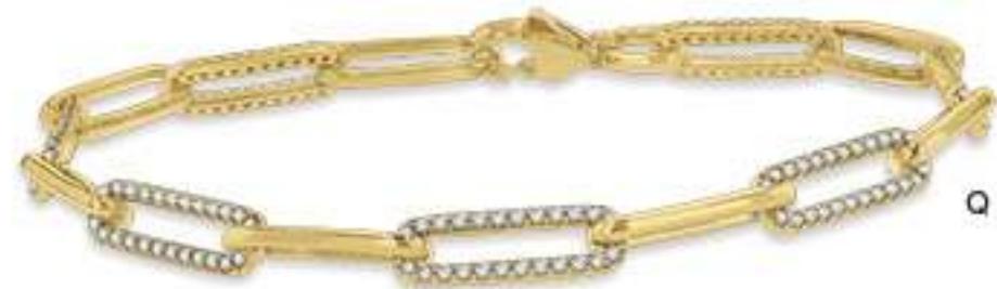
A. 1 1/2 carat tw open link necklace B. 1/5 carat tw open link ring C. 1 carat tw open link bracelet D. 1/10 carat tw open link ring E. 3/4 carat tw open link bracelet F. 1/3 carat tw curb link pendant G. 1 carat tw curb link bracelet H. 1/6 carat tw curb link ring J. 1/3 carat tw curb link hoop earrings K. 1/2 carat tw pave set heart pendant L. 1/2 carat tw pave set cross pendant M. 1/6 carat tw paper clip earrings N. 1/4 carat tw paper clip necklace P. 1/5 carat tw paper clip ring Q. 1 carat tw paper clip bracelet