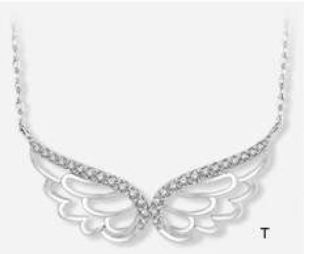
A. Pearl and diamond ring B. Pearl and diamond earrings C. Pearl and diamond pendant D. Pearl and diamond halo pendant E. Pearl and diamond halo earrings F. Pearl and diamond swirl pendant G. 1/5 carat tw love knot earrings H. 1/6 carat tw love knot pendant J. 1/6 carat tw love knot ring K. 1/10 carat tw diamond tag pendant L. 1/20 carat tw diamond tag pendant M. Bezel diamond tag pendant N. 1/4 carat tw square locket pendant P. 1/4 carat tw circle locket pendant Q. 1/4 carat tw heart locket pendant R. 1/8 carat tw angel wing necklace S. 1/12 carat tw angel wing necklace T. 1/6 carat tw angel wing necklace