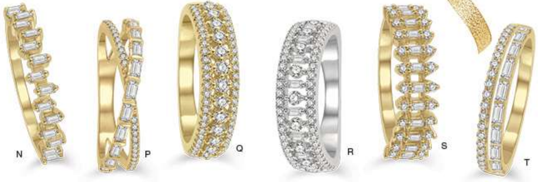
A. circle necklace 1/4 carat tw, 1/2 carat tw B. heart necklace 1/4 carat tw, 1/2 carat tw C. circle necklace 1/4 carat tw, 1/2 carat tw D. 1 carat tw 5 stone emerald band E. 3/4 carat tw fashion band F. 1 carat tw 5 stone oval band G. 1/4 carat tw oval pendant H. 1/4 carat tw oval ring J. 1/2 carat tw double row pendant K. 1 carat tw double row earrings L. 1/3 carat tw drop pendant M. 1/3 carat tw diamond band N. 1/4 carat tw stackable band P. 3/8 carat tw cross over ring Q. 5/8 carat tw diamond band R. 3/4 carat tw fashion band S. 1/2 carat tw fashion band T. 1/2 carat tw fashion band