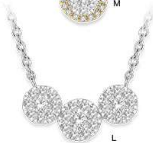
A. 3/4 carat tw bar link earrings B. 1 7/8 carat tw bar link necklace C. 1 carat tw bar link bracelet D. 1/5 carat tw pendant E. 1/4 carat tw pendant F. 1/5 carat tw pendant G. 1/8 carat tw pendant H. 7 stone band 1/2 carat tw, 1 carat tw J. smile necklace 1/2 carat tw, 1 carat tw K. 1 carat tw halo hoop earrings L. 3 stone necklace 1/2 carat tw, 1 carat tw M. 3/4 carat tw pear necklace N. 1/4 carat tw oval pendant P. 1/3 carat tw oval ring Q. 1/4 carat tw oval earrings