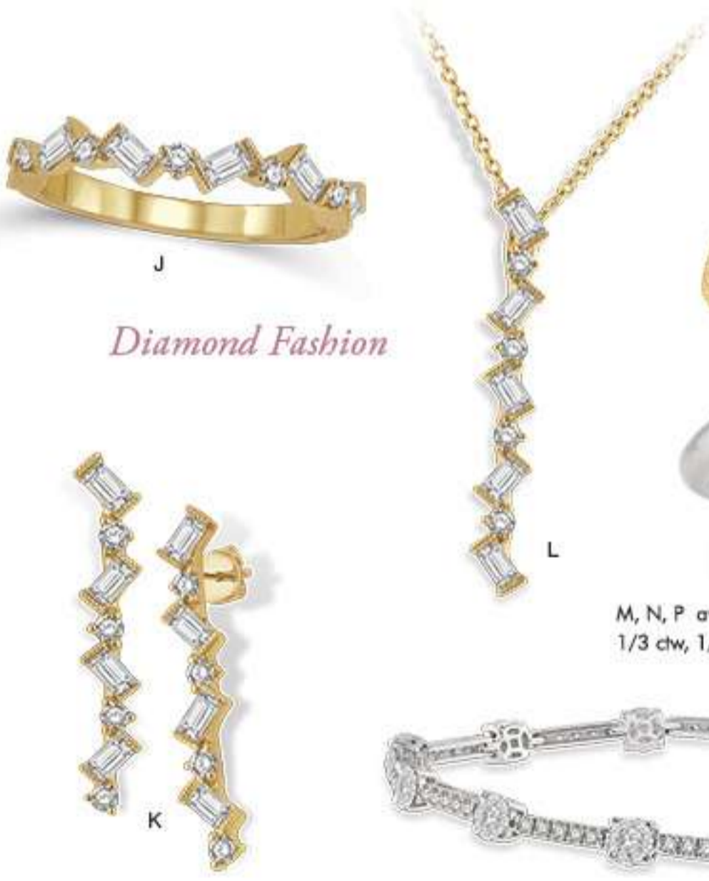
A. 1/3 carat tw scatter necklace B. 1/4 carat tw scatter ring C. 1/2 carat tw scatter necklace D. 1/2 carat tw tear drop earrings E. 1/4 carat tw scatter earrings F. 5/8 carat tw zig-zag band G. 1 carat tw zig-zag hoop earrings H. 3 carat tw zig-zag bracelet J. 1/2 carat tw zig-zag band K. 1/2 carat tw zig-zag earrings L. 1/3 carat tw zig-zag pendant M. halo ring 1/4 carat tw, 1/2 carat tw, 1 carat tw N. halo pendant 1/4 carat tw, 1/2 carat tw, 1 carat tw P. halo earrings 1/4 carat tw, 1/2 carat tw, 1 carat tw Q. 1 3/4 carat tw bar link bracelet