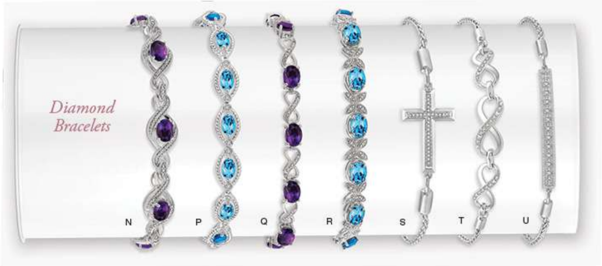
A. 1/10 carat tw paper clip pendant B. 1/10 carat tw heart paper clip pendant C. 1/6 carat tw paper clip bracelet D. 1/10 carat tw paper clip ring E. 1/10 carat tw paper clip hoop earrings F. blue topaz and diamond ring G. blue topaz and diamond pendant H. blue topaz and diamond earrings J. amethyst and diamond ring K. amethyst and diamond pendant L. diamond angel wing earrings M. diamond angel wing pendant N. amethyst and diamond bracelet P. blue topaz and diamond bracelet Q. amethyst and diamond bracelet R. blue topaz and diamond bracelet S. diamond cross lariat bracelet T. diamond infinity lariat bracelet U. diamond bar lariat bracelet

What's New: Sterling silver is a favorite among trendsetters and it mixes well with other metals.