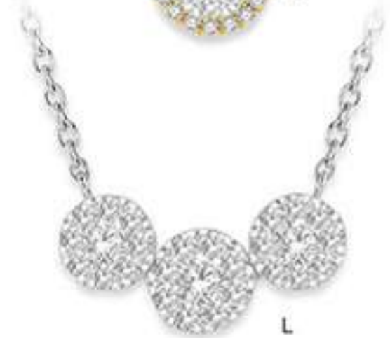
A. 3/4 carat tw bar link earrings $1,749 B. 1 7/8 carat tw bar link necklace $4,599 C. 1 carat tw bar link bracelet $3,099 D. 1/5 carat tw pendant $1,049 E. 1/4 carat tw pendant $1,049 F. 1/5 carat tw pendant $899 G. 1/8 carat tw pendant $599 H. 7 stone band 1/2 carat tw $1,649, 1 carat tw $2,799 J. smile necklace 1/2 carat tw $1,999, 1 carat tw $3,499 K. 1 carat tw halo hoop earrings $3,399 L. 3 stone necklace 1/2 carat tw $1,899, 1 carat tw $3,799 M. 3/4 carat tw pear necklace $1,949 N. 1/4 carat tw oval pendant $999 P. 1/3 carat tw oval ring $1,199 Q. 1/4 carat tw oval earrings $899