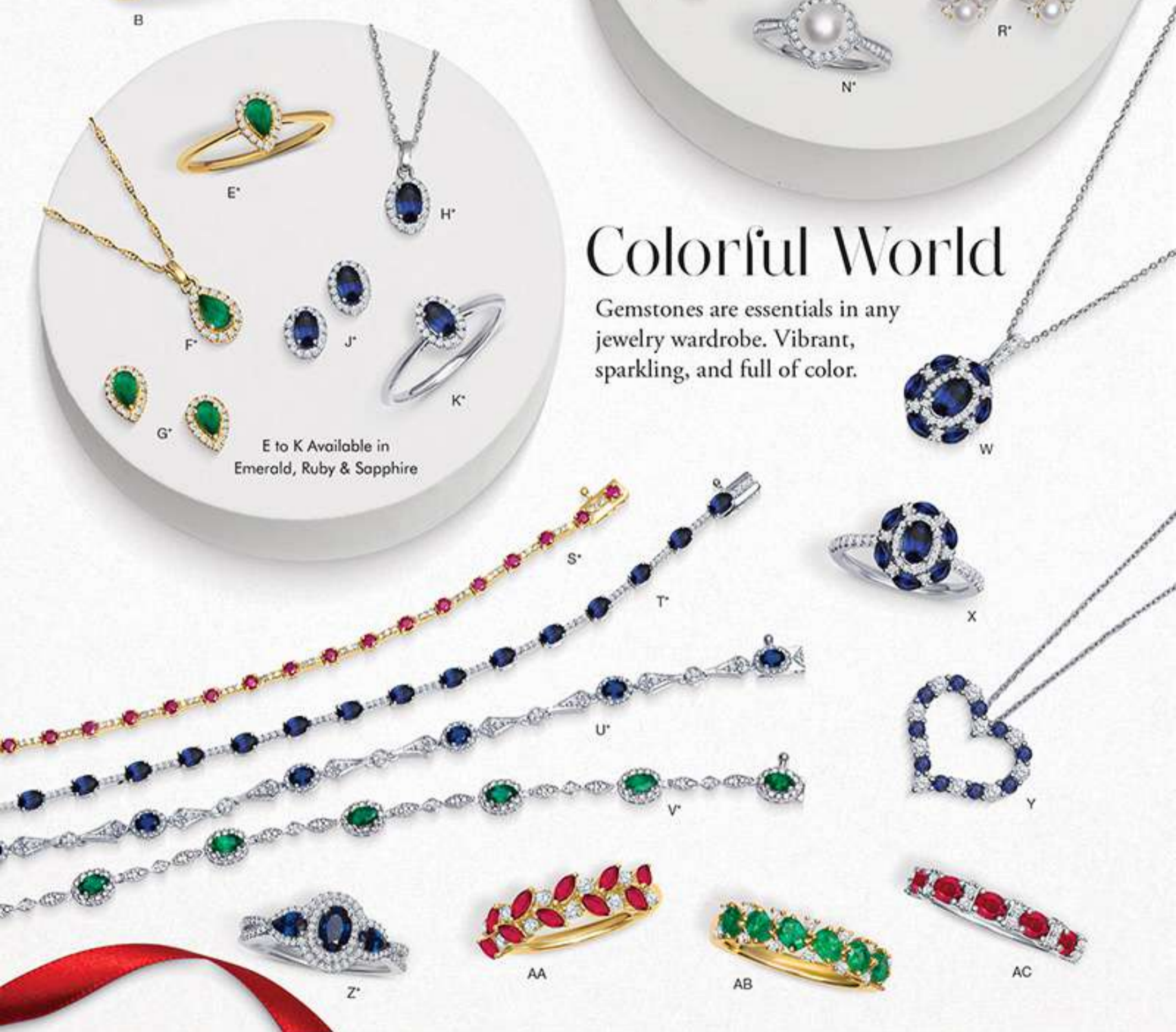
A. Ruby and diamond pendant B. Ruby and diamond ring C. Sapphire and diamond pendant D. Sapphire and diamond ring E. Emerald and diamond ring F. Emerald and diamond pendant G. Emerald and diamond earrings H. Sapphire and diamond pendant J. Sapphire and diamond earrings K. Sapphire and diamond ring L. Pearl and diamond pendant M. Pearl and diamond halo pendant N. Pearl and diamond halo ring P. Pearl and diamond pendant Q. Pearl and diamond ring R. Pearl and diamond earrings S. Ruby and diamond bracelet T. Sapphire and diamond bracelet U. Sapphire and diamond bracelet V. Emerald and diamond bracelet W. Sapphire and diamond pendant X. Sapphire and diamond ring Y. Sapphire and diamond heart pendant 1/8 carat tw, 1/4 carat tw, 1/2 carat tw Z. Sapphire and diamond ring AA. Ruby and diamond band AB. Emerald and diamond band AC. Ruby and diamond band

Gemstones are essentials in any jewelry wardrobe. Vibrant, sparkling, and full of color.