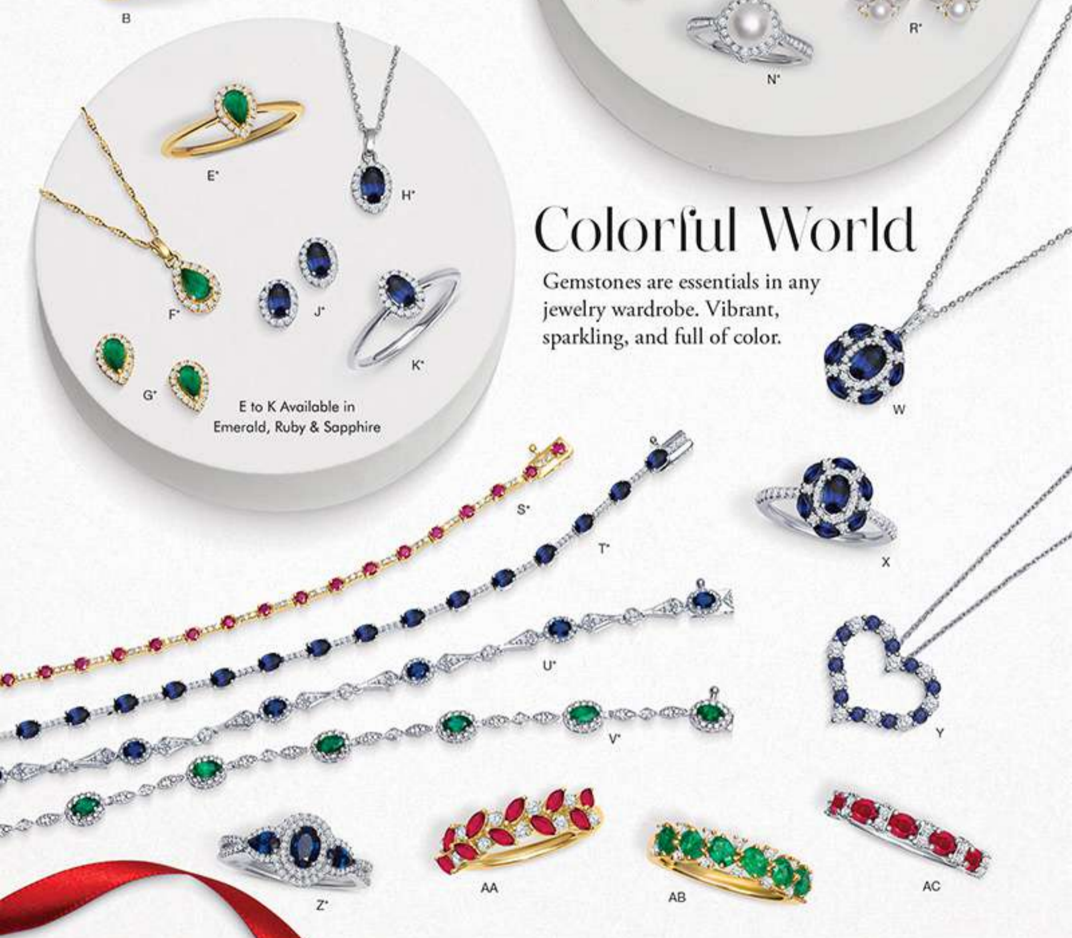
A. Ruby and diamond pendant B. Ruby and diamond ring C. Sapphire and diamond pendant D. Sapphire and diamond ring E. Emerald and diamond ring F. Emerald and diamond pendant G. Emerald and diamond earrings H. Sapphire and diamond pendant J. Sapphire and diamond earrings K. Sapphire and diamond ring L. Pearl and diamond pendant M. Pearl and diamond halo pendant N. Pearl and diamond halo ring P. Pearl and diamond pendant Q. Pearl and diamond ring R. Pearl and diamond earrings S. Ruby and diamond bracelet T. Sapphire and diamond bracelet U. Sapphire and diamond bracelet V. Emerald and diamond bracelet W. Sapphire and diamond pendant X. Sapphire and diamond ring Y. Sapphire and diamond heart pendant 1/8 carat tw, 1/4 carat tw, 1/2 carat tw Z. Sapphire and diamond ring AA. Ruby and diamond band AB. Emerald and diamond band AC. Ruby and diamond band

Gemstones are essentials in any jewelry wardrobe. Vibrant, sparkling, and full of color.