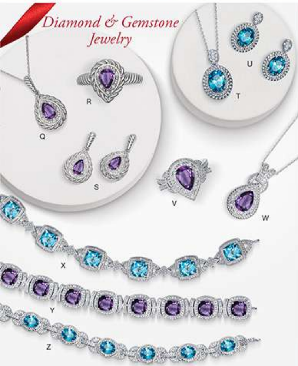
Diamond & Gemstone Jewelry

Whether you're looking to surprise a loved one or treat yourself, the versatility and beauty of silver jewelry make it a perfect choice.