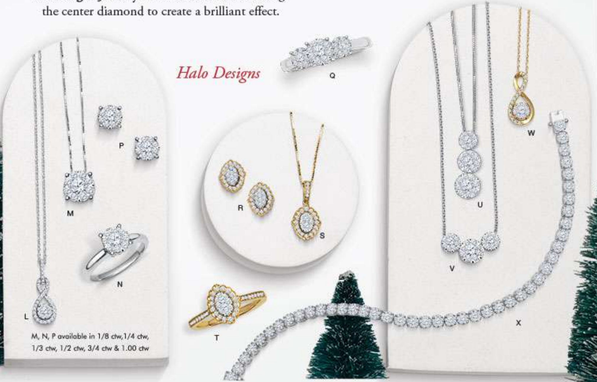
A. 1/2 carat tw scatter necklace B. 1/5 carat tw scatter necklace C. 1/4 carat tw scatter earrings D. 1 carat tw mixed shape diamond pendant E. 1/2 carat tw scatter necklace F. 1/5 carat tw scatter ring G. 1/6 carat tw curb link ring H. 1/3 carat tw curb link hoop earrings J. 1/3 carat tw curb link pendant K. 1 carat tw curb link bracelet L. 1/4 carat tw pendant M. Halo pendant 1/4 carat tw, 1/2 carat tw, 3/4 carat tw, 1 carat tw N. Halo ring 1/4 carat tw, 1/2 carat tw, 3/4 carat tw, 1 carat tw P. Halo earrings 1/4 carat tw, 1/2 carat tw, 3/4 carat tw, 1 carat tw Q. 3 stone ring 1/3 carat tw, 1/2 carat tw, 1 carat tw R. 1/4 carat tw oval earrings S. 1/4 carat tw oval pendant T. 1/3 carat tw oval ring U. 3 stone pendant 1/4 carat tw, 1/2 carat tw, 3/4 carat tw, 1 carat tw V. 3 stone pendant 1/3 carat tw, 1/2 carat tw, 3/4 carat tw, 1 carat tw W. 1/5 carat tw pendant X. Halo bracelet 3 carat tw 5 carat tw