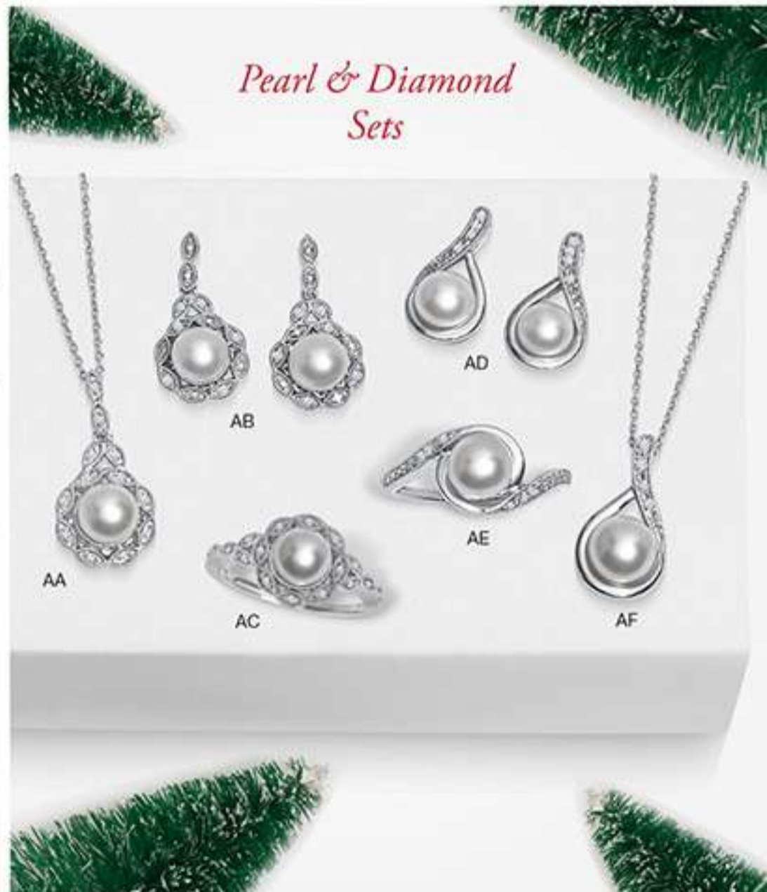
Pearl & Diamond Sets

A. Diamond rectangular medallion pendant B. Diamond cross pendant C. Diamond infinity cross pendant D. Diamond snowflake pendant E. Diamond twin heart pendant F. Diamond round medallion pendant G. Diamond heart arrow pendant H. Diamond min heart pendant J. Diamond infinity heart pendant K. Diamond angel wing pendant L. Diamond crosslariat bracelet M. Diamond bar lariat bracelet N. Diamond infinity lariat bracelet P. Diamond angel wing earrings Q. Amethyst and diamond pendant R. Amethyst and diamond ring S. Amethyst and diamond earrings T. Blue topaz and diamond pendant U. Blue topaz and diamond earrings V. Amethyst and diamond ring W. Amethyst and diamond pendant X. Blue topaz and diamond bracelet Y. Amethyst and diamond bracelet Z. Blue topaz and diamond bracelet AA. Pearl and diamond pendant AB. Pearl and diamond earrings AC. Pearl and diamond ring AD. Pearl and diamond earrings AE. Pearl and diamond ring AF. Pearl and diamond pendant