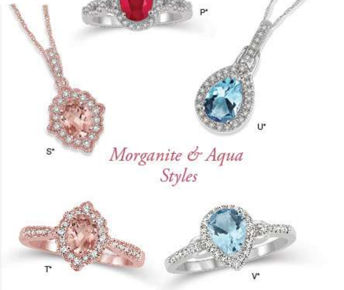
A. circle of love pendants, 1/4 carat tw 1/2 carat tw B. smile necklaces, 1/4 carat tw 1/2 carat tw C. oval pendants, 1/4 carat tw 1/2 carat tw D. diamond inside-out hoop earrings, 1/2 carat tw 1 carat tw E. smile necklace, 1/2 carat tw 1 carat tw F. halo ring, 1/2 carat tw 1 carat tw G. 1 carat tw halo hoop earrings H. emerald and diamond pendant J. emerald and diamond ring K. emerald and diamond ring L. sapphire and diamond ring M. Sapphire and diamond ring N. sapphire and diamond pendant P. ruby and diamond ring Q. ruby and diamond pendant R. ruby and diamond ring S. morganite and diamond pendant T. morganite and diamond ring U. aquamarine and diamond pendant V. aquamarine and diamond ring W. 1/10 carat tw bracelet X. 1/10 carat tw bracelet Y. 1/10 carat tw bracelet Z. tennis bracelet, 1 carat tw 2 carat tw AA. sapphire and diamond bracelet AB. ruby and diamond bracelet AC. tanzanite and diamond bracelet AD. emerald and diamond bracelet