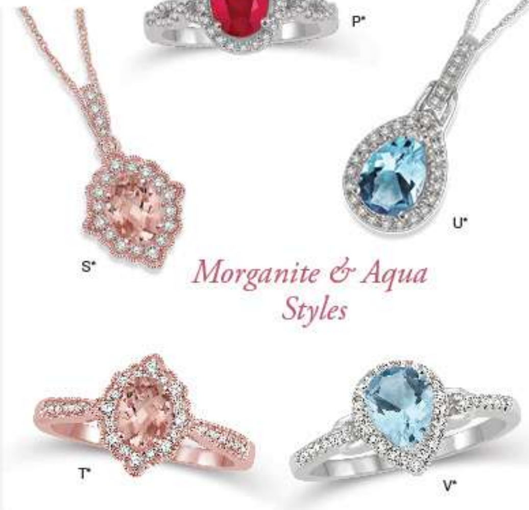
A. circle of love pendants, 1/4 carat tw 1/2 carat tw B. smile necklaces, 1/4 carat tw 1/2 carat tw C. oval pendants, 1/4 carat tw 1/2 carat tw D. diamond inside-out hoop earrings, 1/2 carat tw 1 carat tw E. smile necklace, 1/2 carat tw 1 carat tw F. halo ring, 1/2 carat tw 1 carat tw G. 1 carat tw halo hoop earrings H. emerald and diamond pendant J. emerald and diamond ring K. emerald and diamond ring L. sapphire and diamond ring M. Sapphire and diamond ring N. sapphire and diamond pendant P. ruby and diamond ring Q. ruby and diamond pendant R. ruby and diamond ring S. morganite and diamond pendant T. morganite and diamond ring U. aquamarine and diamond pendant V. aquamarine and diamond ring W. 1/10 carat tw bracelet X. 1/10 carat tw bracelet Y. 1/10 carat tw bracelet Z. tennis bracelet, 1 carat tw 2 carat tw AA. sapphire and diamond bracelet AB. ruby and diamond bracelet AC. tanzanite and diamond bracelet AD. emerald and diamond bracelet