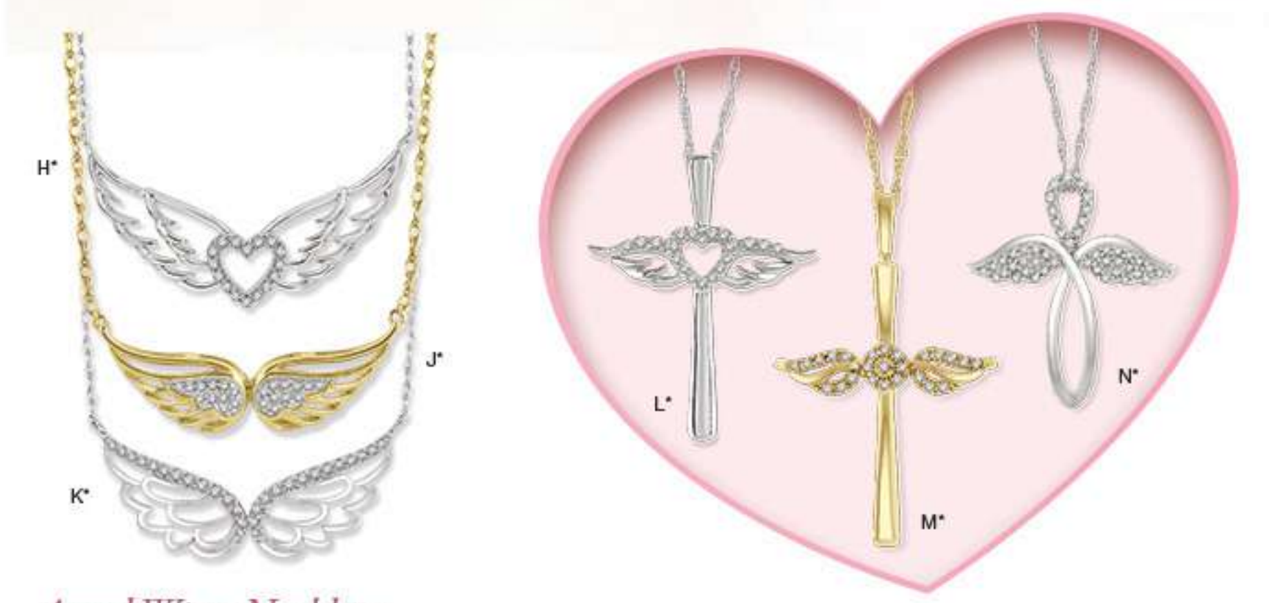
Angel Wing Necklace