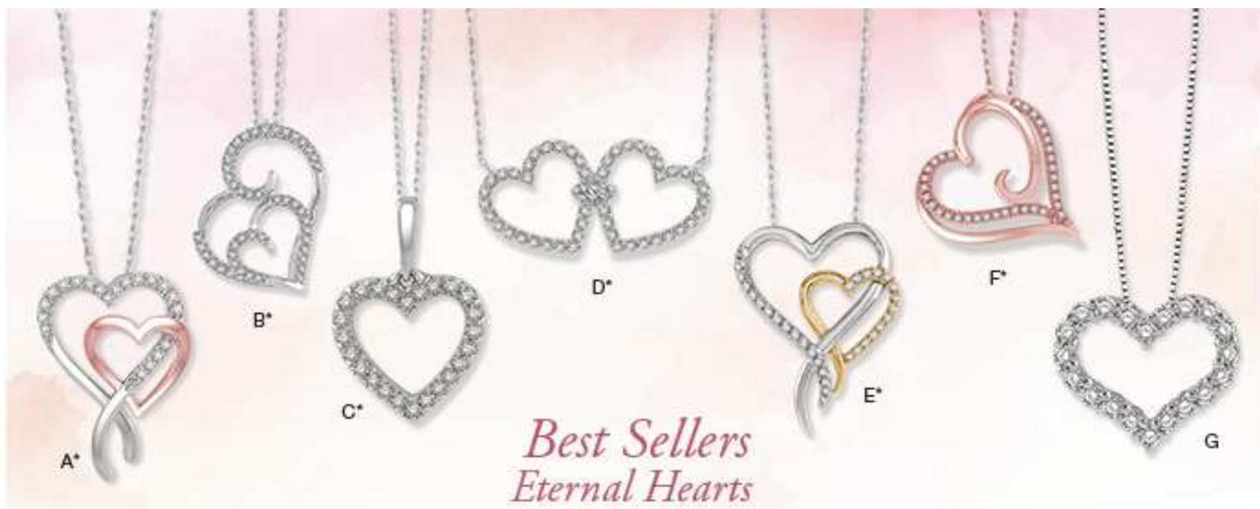
Best Sellers Eternal Hearts