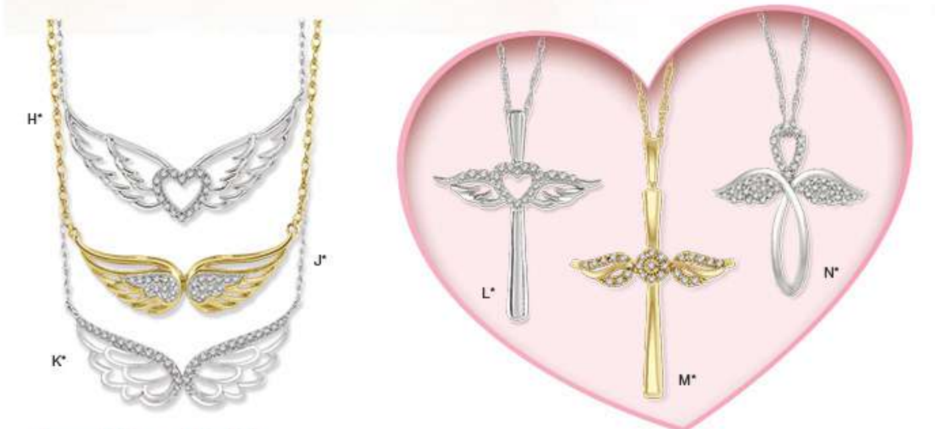
Angel Wing Necklace