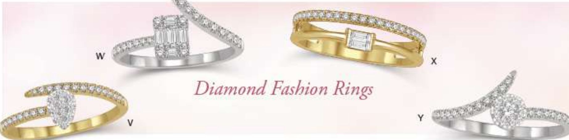
Diamond Fashion Rings