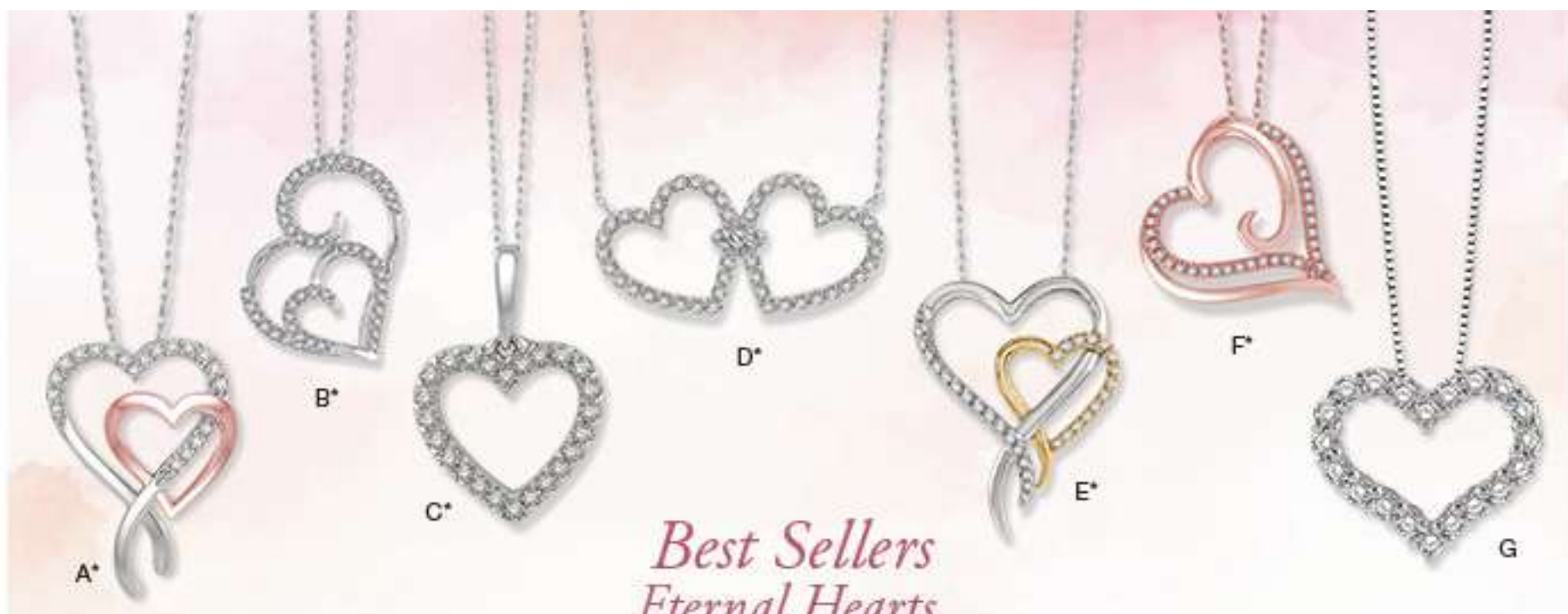
Best Sellers Eternal Hearts