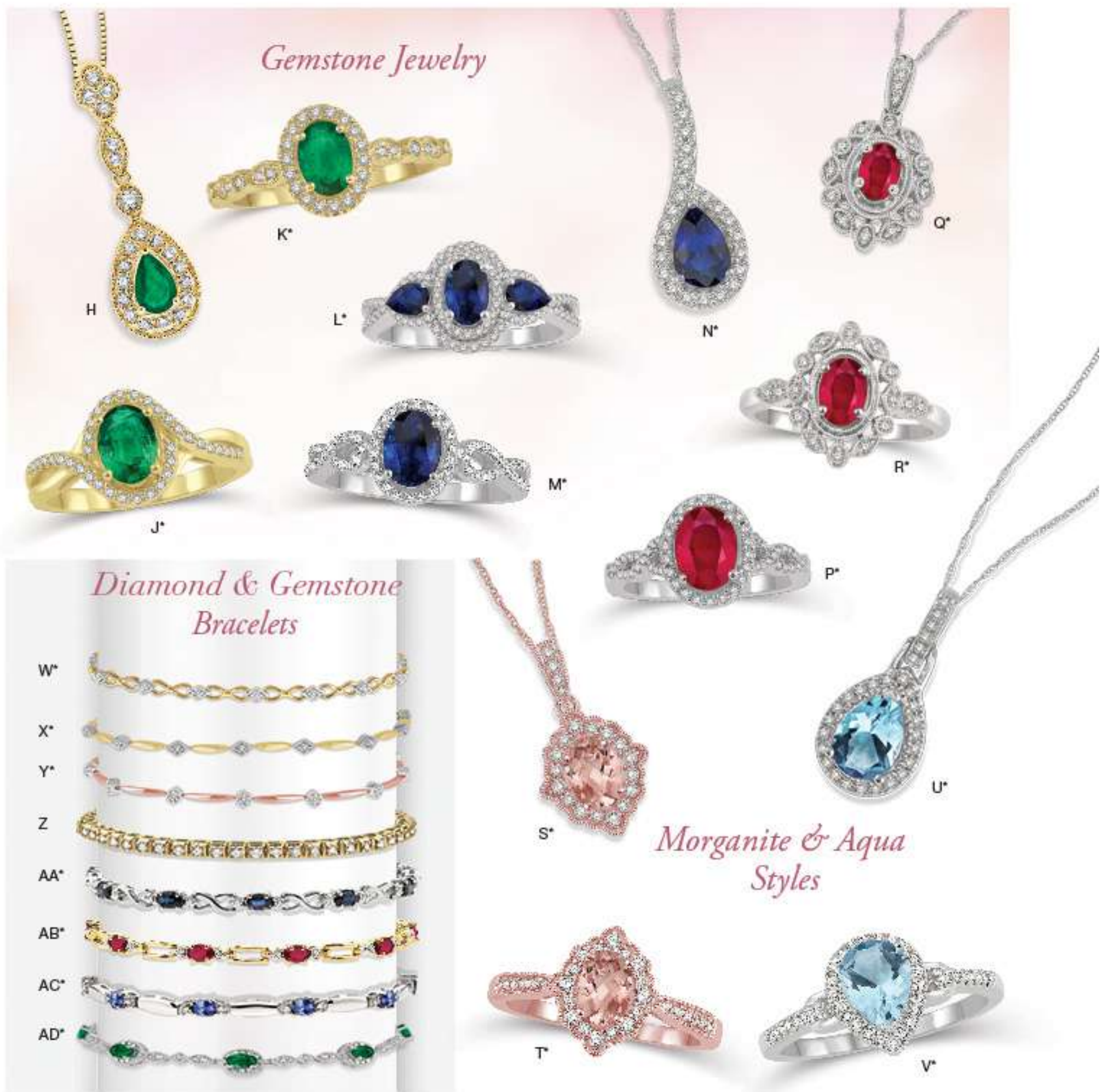
A. circle of love pendants, 1/4 carat tw 1/2 carat tw B. smile necklaces, 1/4 carat tw 1/2 carat tw C. oval pendants, 1/4 carat tw 1/2 carat tw D. diamond inside-out hoop earrings, 1/2 carat tw 1 carat tw E. smile necklace, 1/2 carat tw 1 carat tw F. halo ring, 1/2 carat tw 1 carat tw G. 1 carat tw halo hoop earrings H. emerald and diamond pendant J. emerald and diamond ring K. emerald and diamond ring L. sapphire and diamond ring M. Sapphire and diamond ring N. sapphire and diamond pendant P. ruby and diamond ring Q. ruby and diamond pendant R. ruby and diamond ring S. morganite and diamond pendant T. morganite and diamond ring U. aquamarine and diamond pendant V. aquamarine and diamond ring W. 1/10 carat tw bracelet X. 1/10 carat tw bracelet Y. 1/10 carat tw bracelet Z. tennis bracelet, 1 carat tw 2 carat tw AA. sapphire and diamond bracelet AB. ruby and diamond bracelet AC. tanzanite and diamond bracelet AD. emerald and diamond bracelet