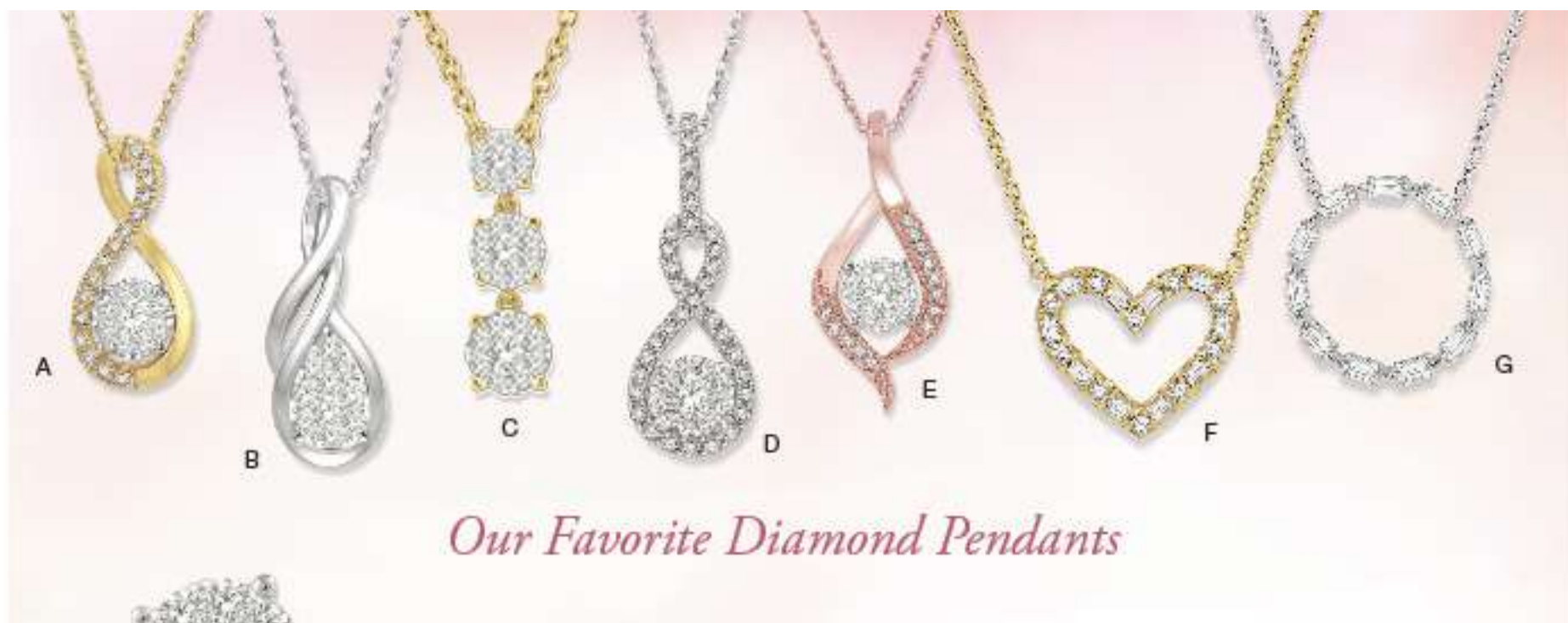
Our Favorite Diamond Pendants