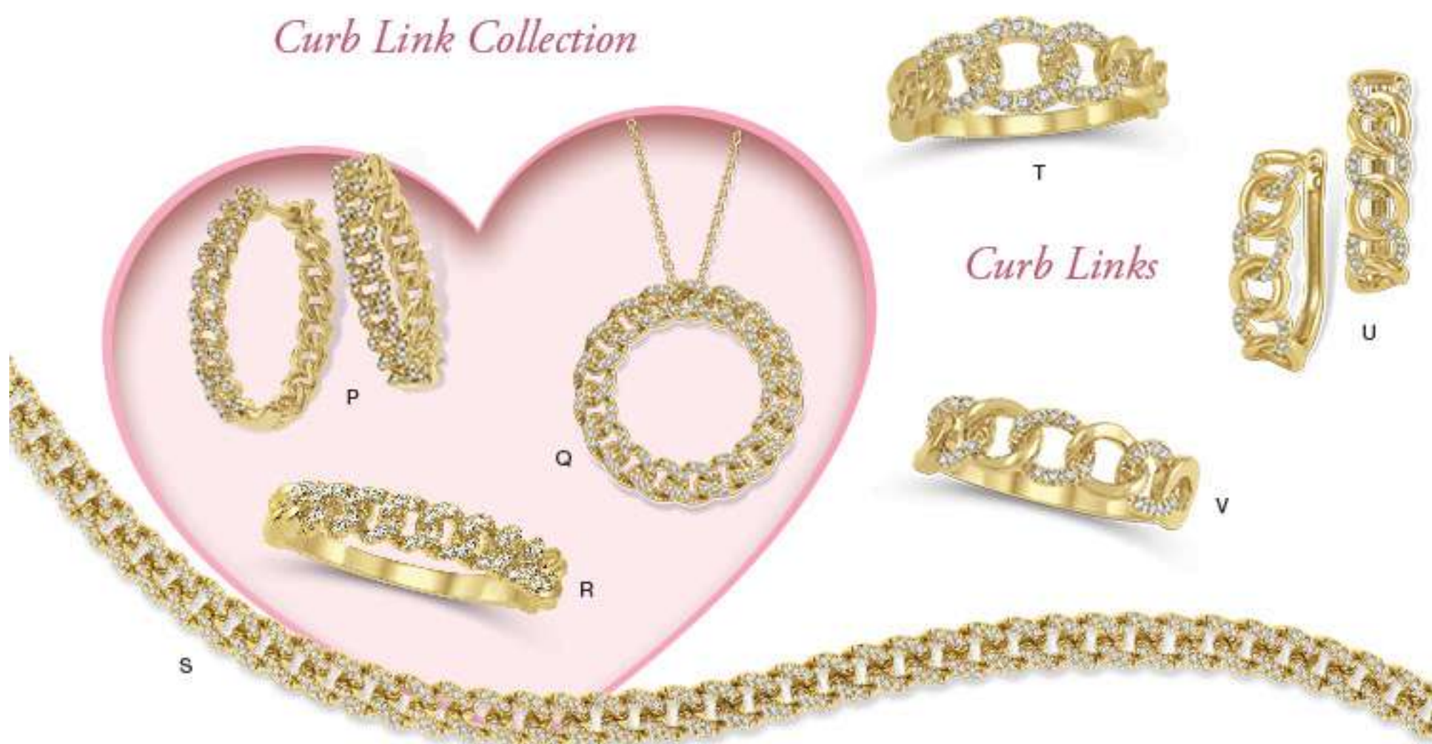
A. 3/8 carat tw pendant B. 1/3 carat tw ring C. 5/8 carat tw earrings D. 3/4 carat tw necklace E. 1 1/5 carat tw bracelet F. 1/6 carat tw paper clip earrings G. 1/4 carat tw paper clip necklace H. 1 carat tw paper clip bracelet J. 1/10 carat tw paper clip ring K. 1/3 carat tw paper clip earrings L. 1/10 carat tw paper clip necklace M. 1 carat tw paper clip bracelet N. 1/5 carat tw paper clip ring P. 1/3 carat tw curb link hoop earrings Q. 1/3 carat tw curb link pendant R. 1/6 carat tw curb link ring S. 1 carat tw curb link bracelet T. 1/6 carat tw curb link ring U. 1/4 carat tw curb link hoop earrings V. 1/10 carat tw curb link ring