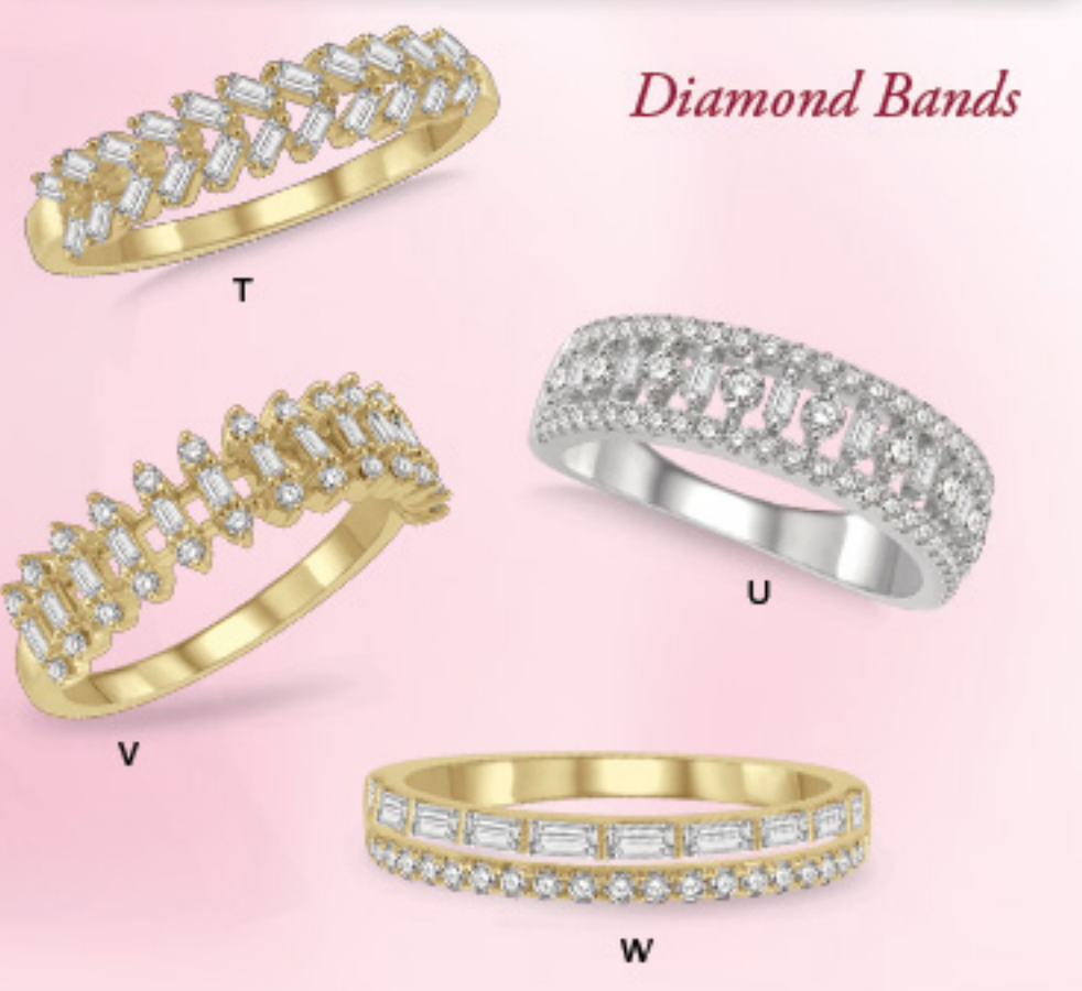
A. Tennis necklace 3 carat tw 5 carat tw B. 5 carat tw riviera necklace C. 1 carat tw tennis earrings D. 1 1/2 carat tw riviera earrings E. 1/4 carat tw drop station necklace F. Round station necklace 1/4 carat tw 1/2 carat tw 1 carat tw G. 1/10 carat tw icicle station necklace H. 1/2 carat tw scatter necklace J. 1/4 carat tw scatter earrings K. 1/4 carat tw scatter ring L. 1/4 carat tw baguette station bracelet M. Round station bracelet 1/4 carat tw 1/2 carat tw 1 carat tw N. 1/6 carat tw heart station bracelet P. 1/6 carat tw cushion station bracelet Q. Ruby and diamond bracelet R. Sapphire and diamond bracelet S. Emerald and diamond bracelet T. 1/4 carat tw fashion band U. 3/4 carat tw fashion band V. 1/2 carat tw fashion band W. 1/2 carat tw fashion band