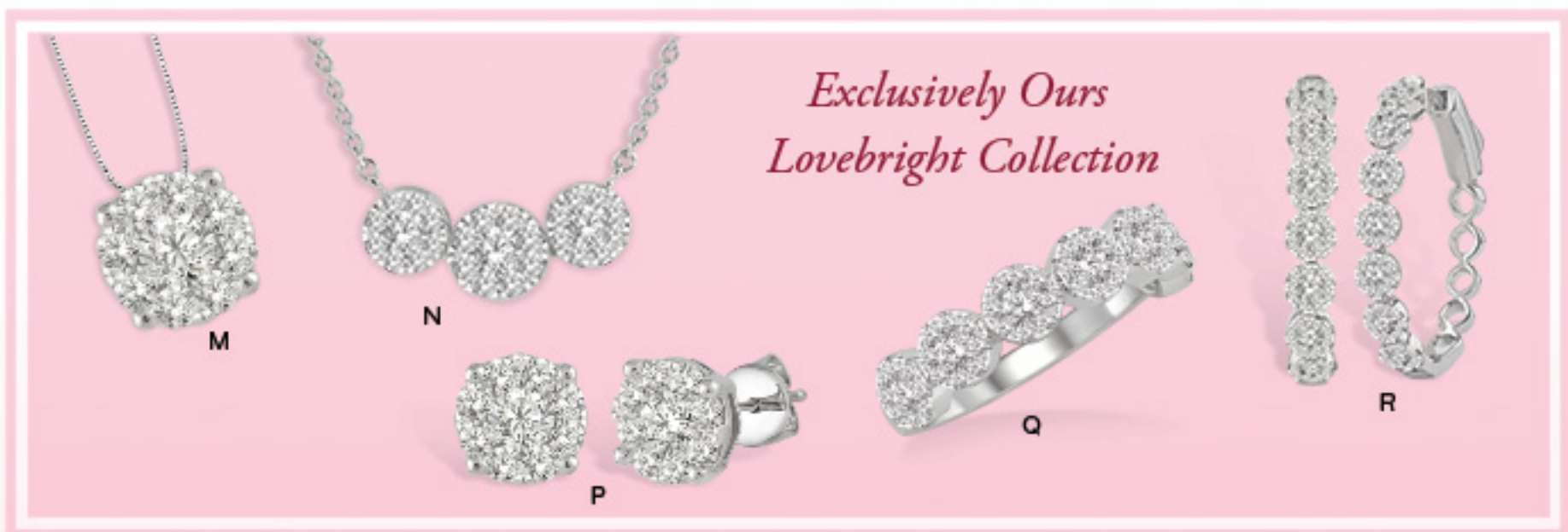
Exclusively Ours Lovebright Collection