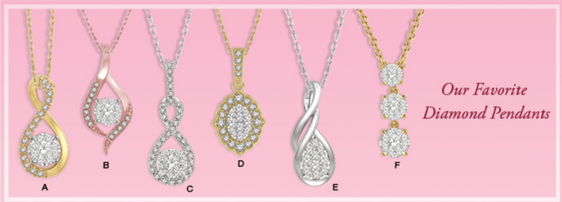
Our Favorite Diamond Pendants

Give them your heart with thoughtful pieces that say it all.