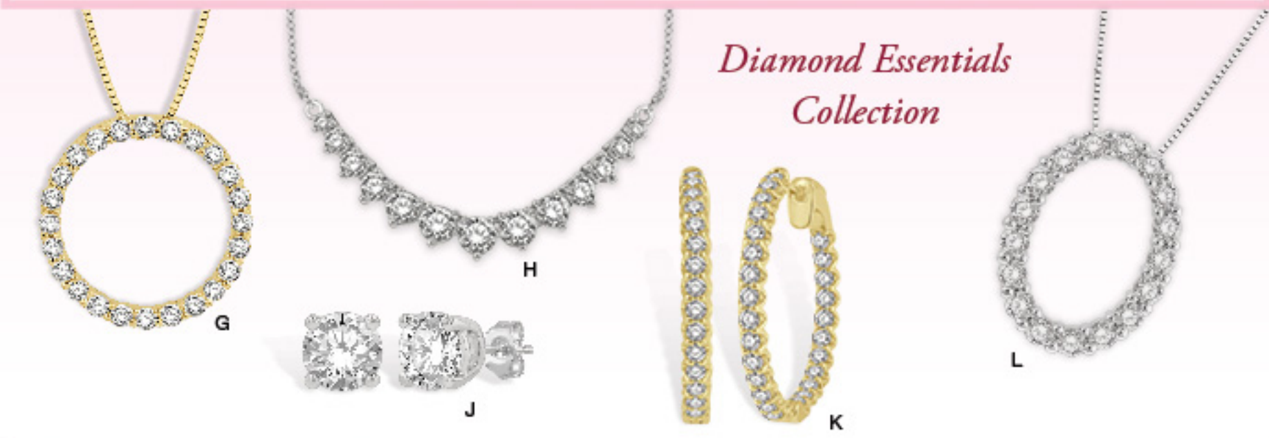
Diamond Essentials Collection